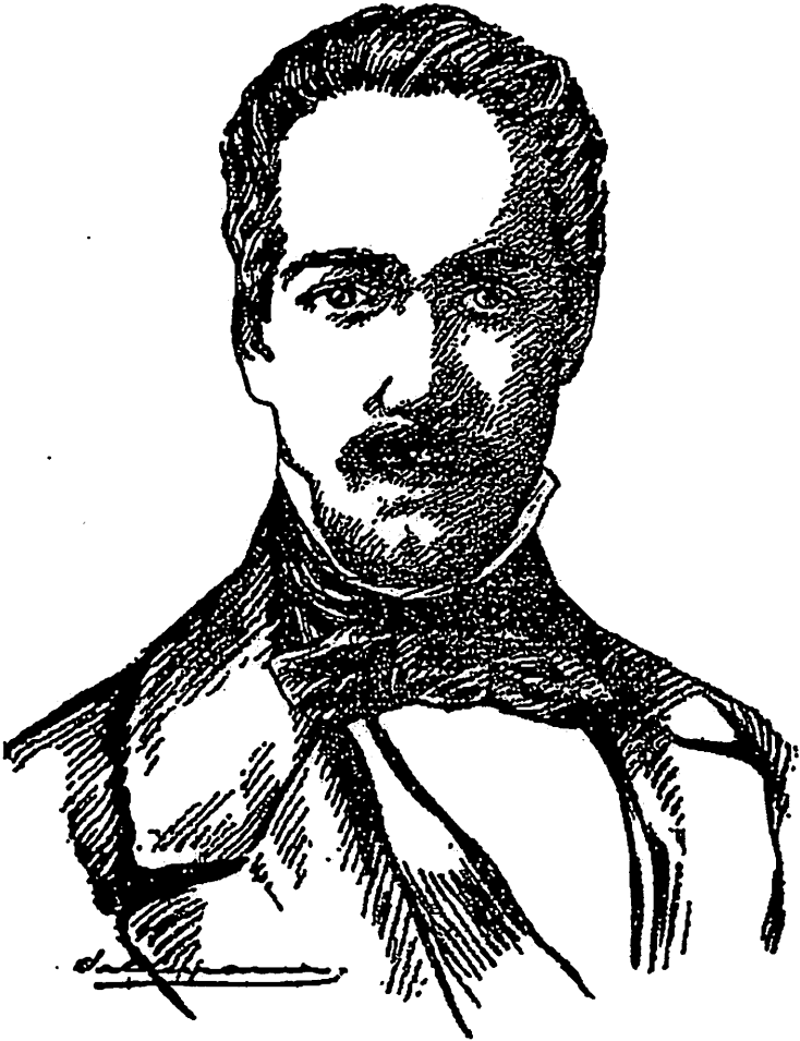
ISIDORO DE ARMENTEROS